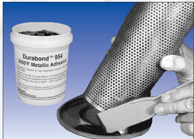
Durabond™ 954 Bonds a Stainless Filter Cartridge for use at 1200°F